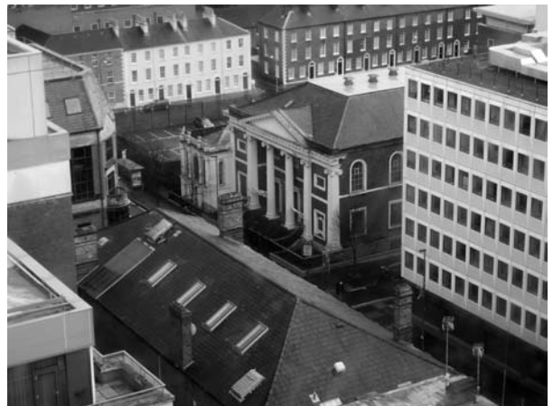
Bird's eye view: Historic May Street Church as seen from the Belfast Eye - a good opportunity to check over the roof.